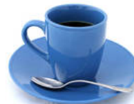
Your father- coffee