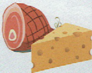
ham & cheese

4) Tu organises un pic-nique pour ton anniversaire. Tu fais la liste de ce que tu dois acheter. (complète les pointillés).